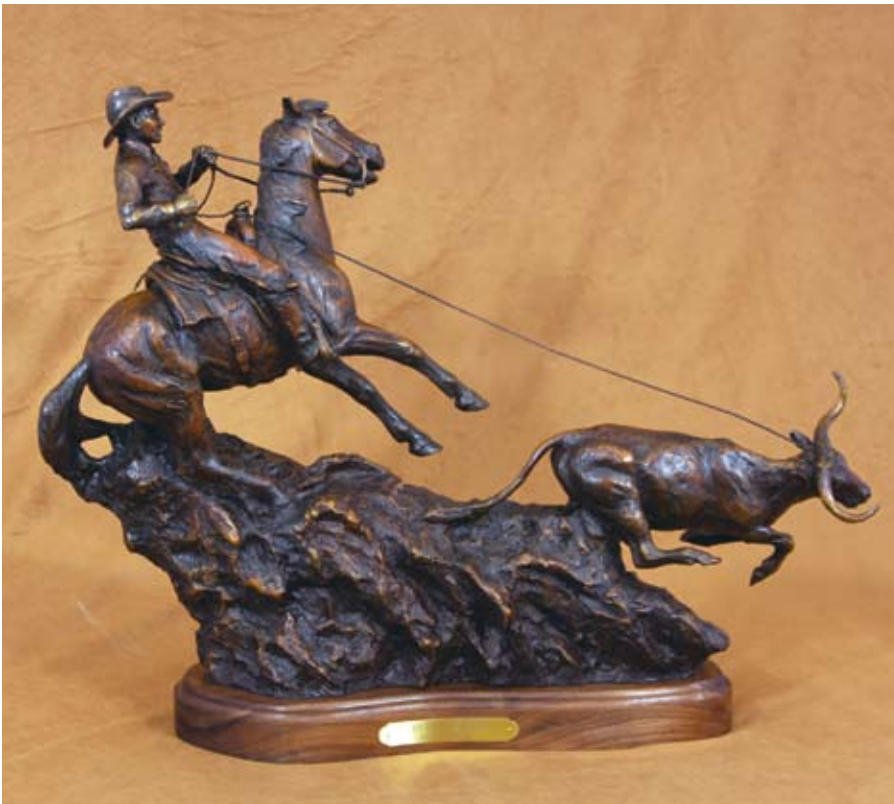
Down Hill From Here , bronze, ed. of 15, 27 x 21"