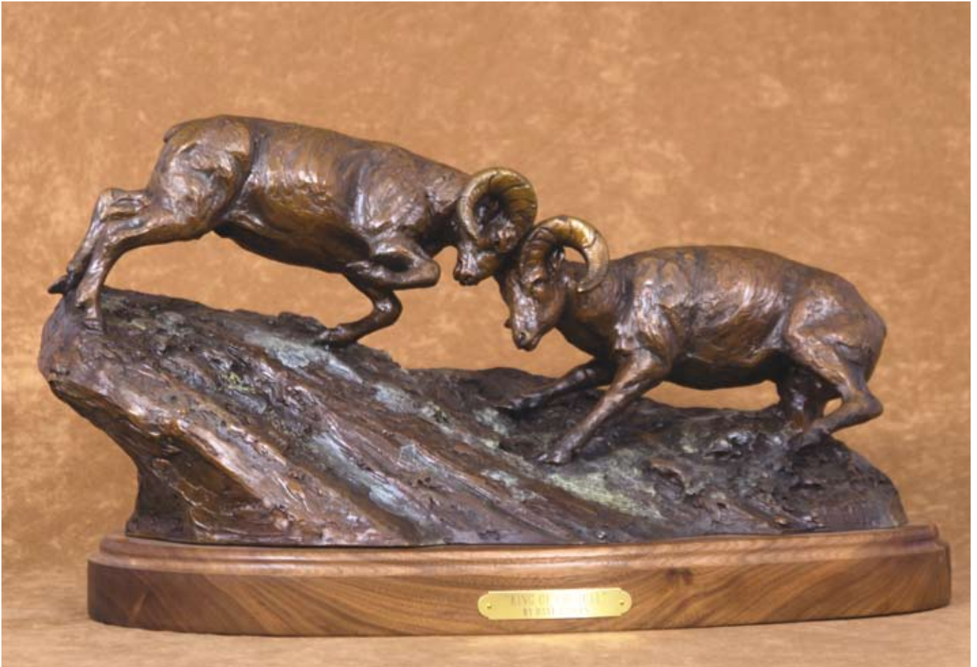
King of the Hill , bronze, ed. of 24, 19 x 12"