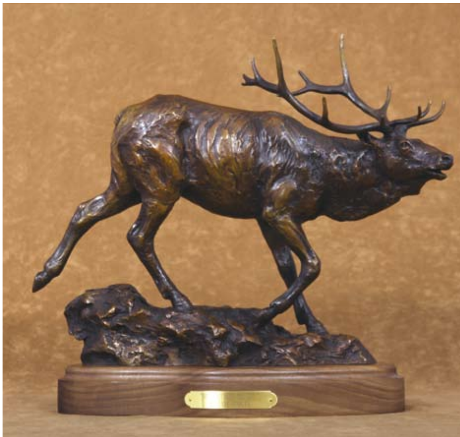
Mountain Music , bronze, ed. of 30, 17 x 14"