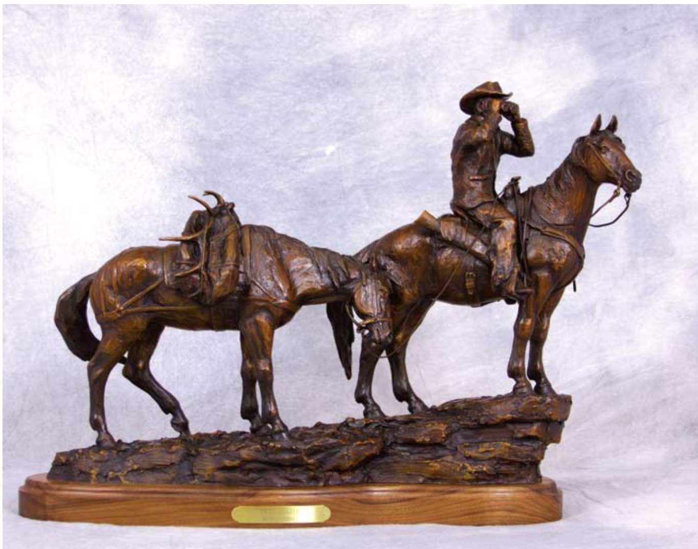
Trail Blazer , bronze, ed. of 15, 30 x 21"