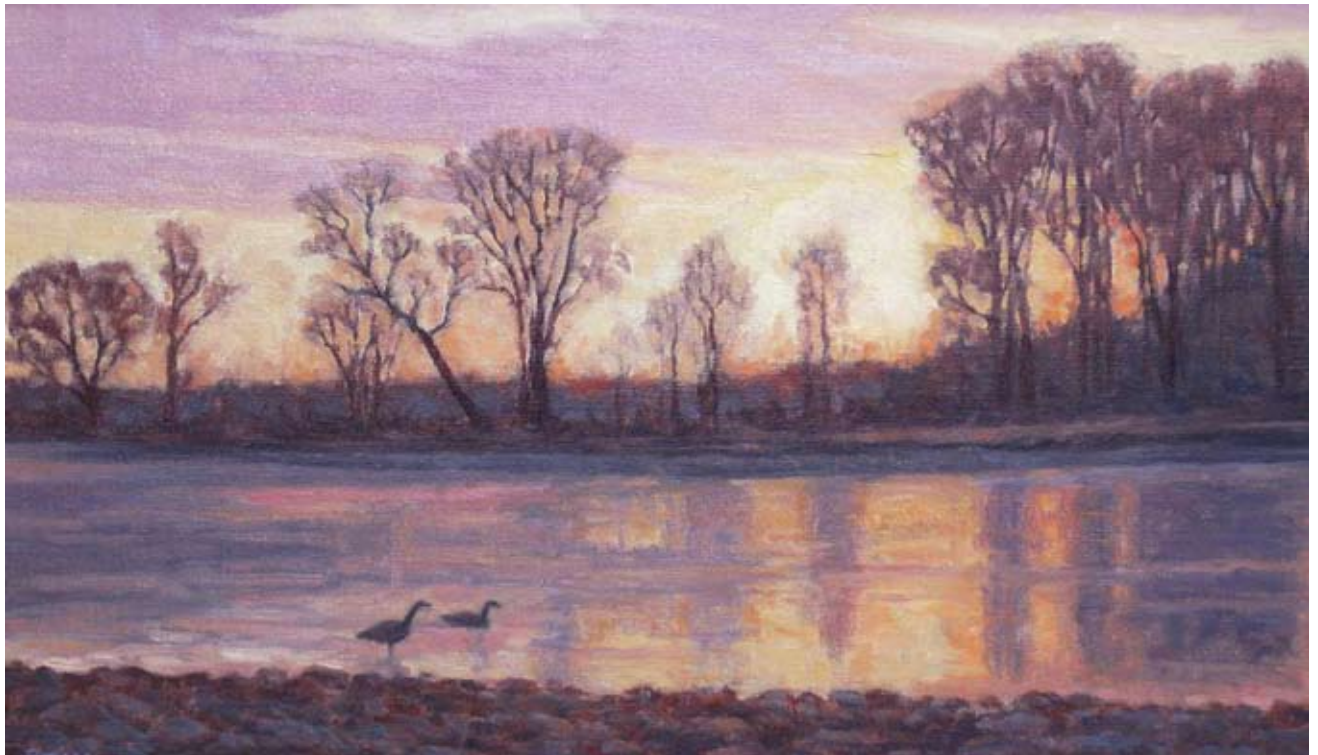
First Spring Arrivals , oil on linen, 12 x 20"