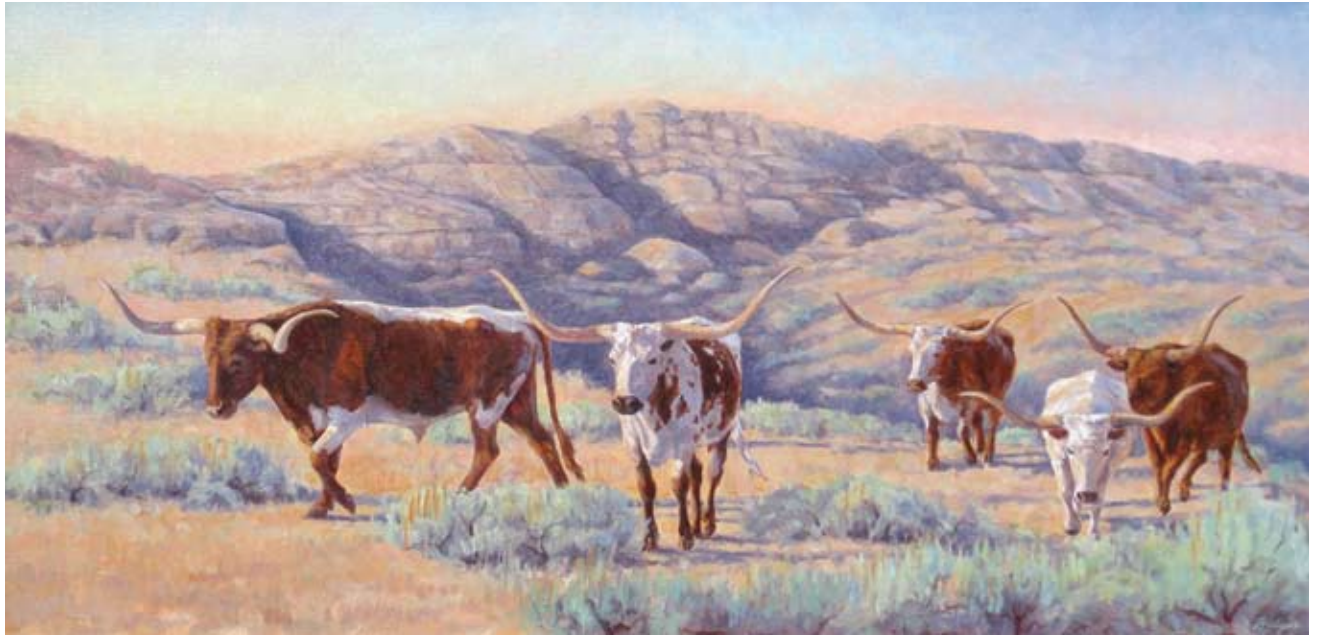
Early Morning Move , oil on linen, 15 x 30"